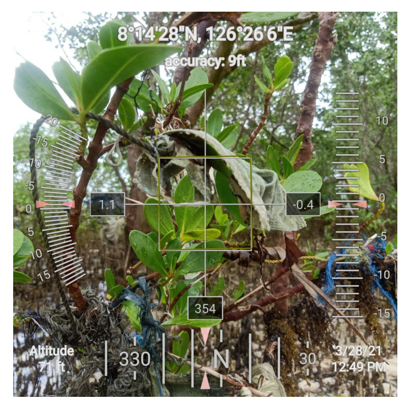
Fig 1. A photo contributed by a volunteer of a disposable facemask in a mangrove area in Northern part of Mindanao, Philippines, taken from a smartphone with geotagging app. Notice the coordinates on the top part of the photo that can be useful in distribution studies.

To provide baseline data on the presence of marine litter associated with COVID-19, we recruited volunteers through social media to contribute geotagged photos of COVID-19 related litter in coastal areas of Mindanao, Philippines from 22 March 2021 to 6 August 2021. Using their personal smartphones, volunteers were asked to download free geotagging apps to capture photos with GPS coordinates (Fig. 1). GPS coordinates from each contributed photo was then plotted on a map using QGIS 3.12, an open-source geographic information system application (https://qgis.org) to look at the presence of COVID-19 litter in a relatively large spatial scale.