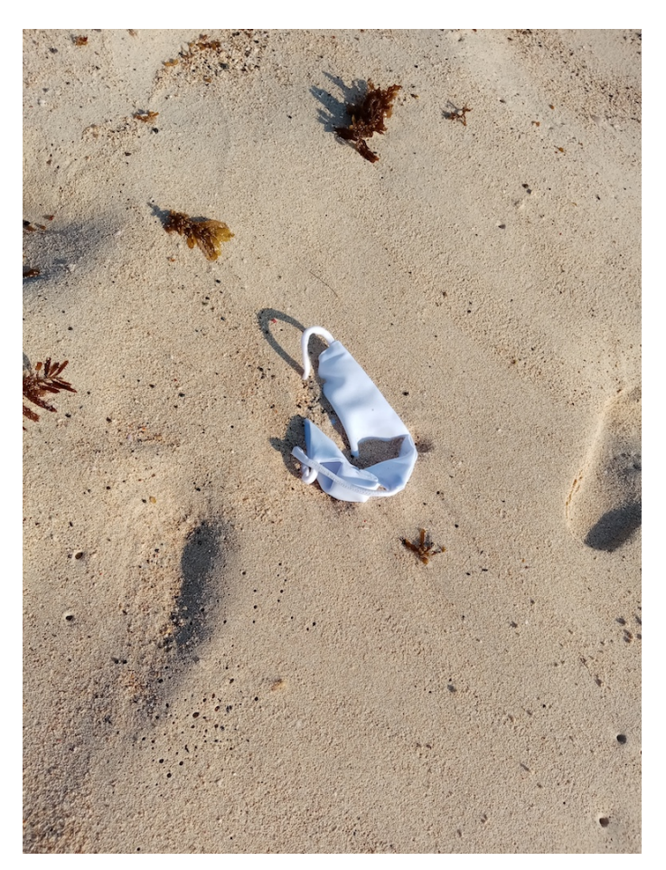
Fig 3. Reusable face mask discarded on a beach in Davao Oriental, Philippines. This was contributed by a volunteer; however, it was not included in the data set as it lacked GPS coordinates.

Moreover, disposable face masks are a potential source of secondary microplastics as it breaks up into smaller pieces in the marine environment (Fadare and Okoffo, 2020).